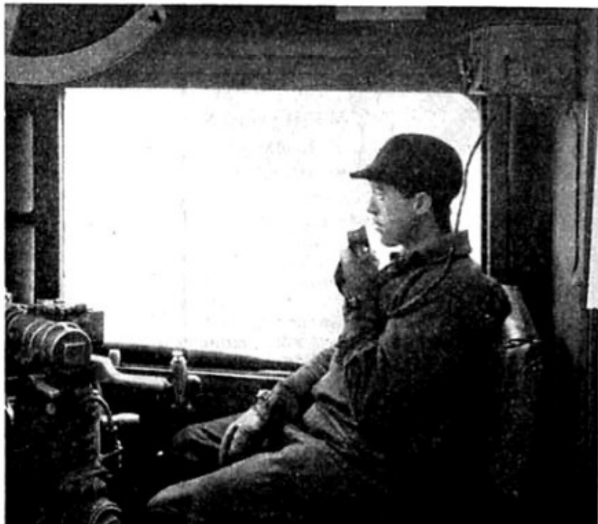
Photo showing engine man using a microphone of radio equipment used for radio communication on train.

The power unit for the equipment, which contains the necessary dynamotors, filter condensers, reactors, etc., is also housed in a metal container. Two dynamotors are utilized. The larger one